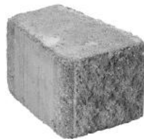
Small 6" x 6" x 9" 20 lbs. - .21 sq. ft.

COMBO PALLET—(6" + 12" = 1 PAIR) 48 Medium plus 48 Small per pallet 3760 lbs. per pallet 32 sq. ft. per pallet