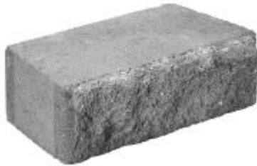
Large 6" x 18" x 9" 70 lbs. - .71 sq. ft.

LARGE PALLET 40 each per pallet 2800 lbs. per pallet 28.4 sq. ft. per pallet