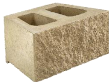
8" x 18" x 12" 72 lbs., 1 sq. ft.