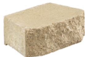
4" X 12" X 8" 25 lbs. .33 sq. ft.