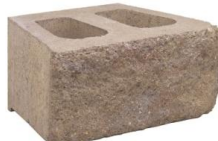
8" x 18" x 12" 77 lbs., 1 sq. ft.