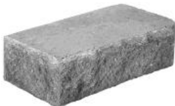
18" x 6" x 9" 75 lbs. - 1.13 sq. ft.

COLUMN UNIT— SPLIT ON ONE FACE AND END 3000 lbs. per pallet 40 each per pallet