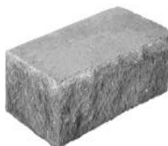
8" x 9" x 18" 105 lbs.