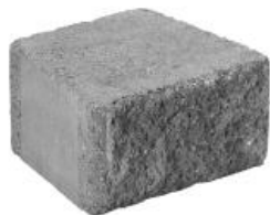
Medium 6" x 12" x 9" 45 lbs. - .46 sq. ft.